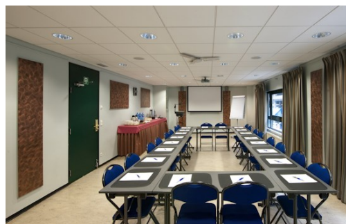
ROSA PARKS MEETING ROOM