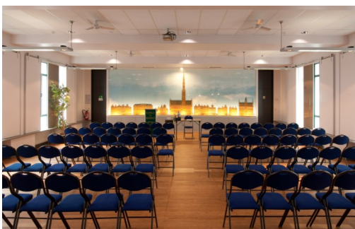
NELSON MANDELA MEETING ROOM